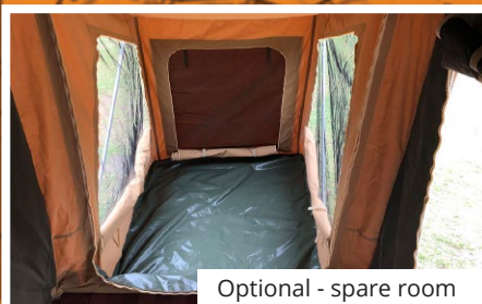
Optional - spare room