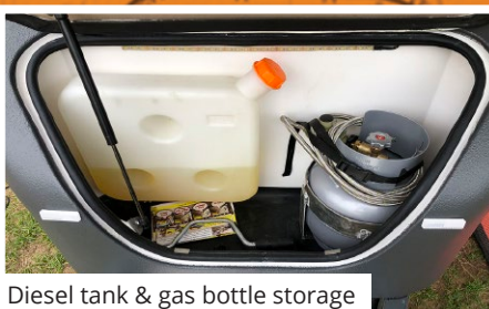
Diesel tank & gas bottle storage